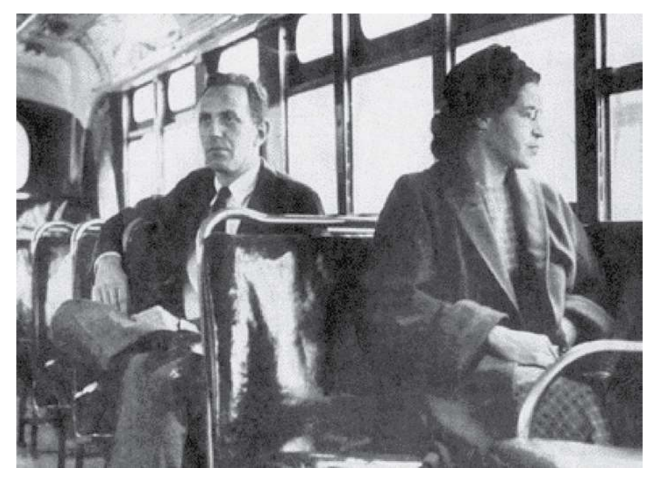
Rosa Parks, an African— American woman, changed the course of American history with one defiant act.