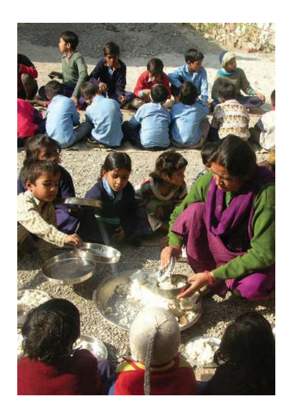
Children being served their midday meal at a government school in Uttarakhand.

What is the midday meal programme? Can you list three benefits of the programme? How do you think this programme might help promote greater equality?