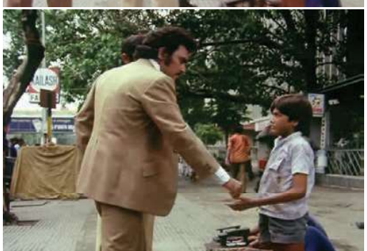
In the 1975 film, Deewar, a boy who works as a shoeshine refuses to pick up a coin thrown at him. He feels that there is dignity in the work that he does and insists that his fee be given respectfully.