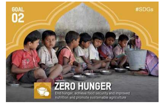
Sustainable Development Goal (SDG) www.in.undp.org

One of the steps taken by the government includes the midday meal scheme. This refers to the programme introduced in all government elementary schools to provide children with cooked lunch. Tamil Nadu was the first state in India to introduce this scheme, and in 2001, the Supreme Court asked all state governments to begin this programme in their schools within six months. This programme has had many positive effects. These include the fact that more poor children have begun enrolling and regularly attending school. Teachers reported that earlier