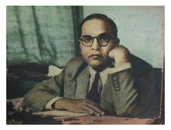
"It is disgraceful to live at the cost of one's self-respect. Self-respect is the most vital factor in life. Without it, man is a cipher. To live worthily with self-respect, one has to overcome difficulties. It is out of hard and ceaseless struggle alone that one derives strength, confidence and recognition.

Rosa Parks (1913–2005) was an African–American woman. Tired from a long day at work she refused to give up her seat on a bus to a white man on 1 December 1955. Her refusal that day started a huge agitation against the unequal ways in which African–Americans were treated and which came to be known as the Civil Rights Movement . The Civil Rights Act of 1964 prohibited discrimination on the basis of race, religion or national origin. It also stated that all schools would be open to African–American children and that they would no longer have to attend